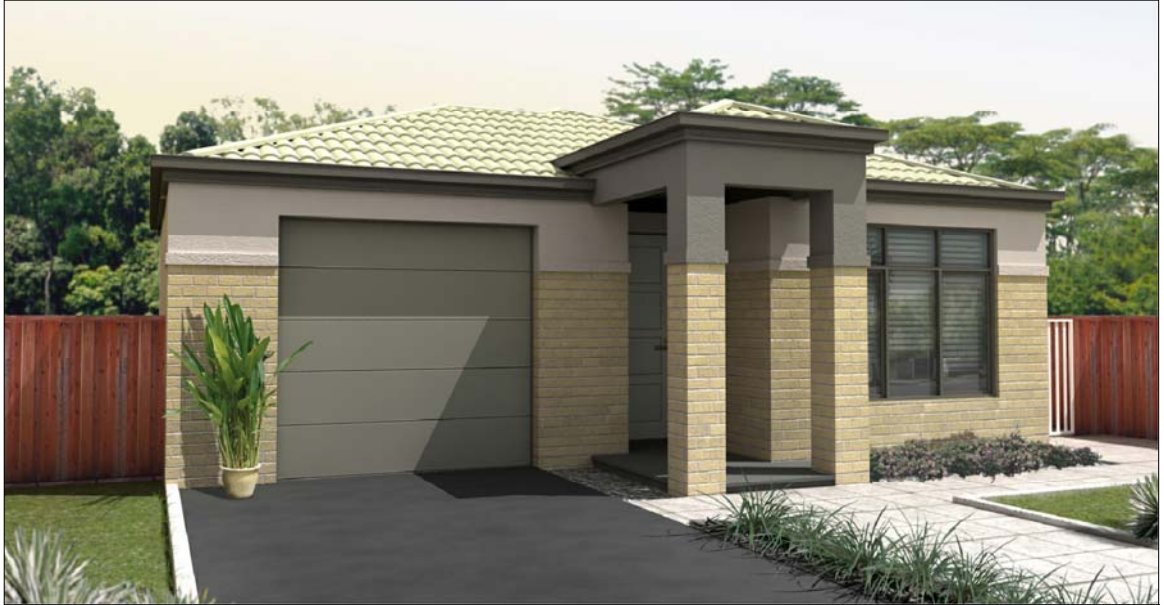
TRADITIONAL (T3) FACADE: concrete tiled roof